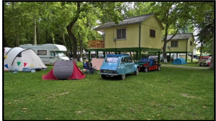
Campsite near Budapest, Hungary.

We did not take a direct route home and travelled North East to the Hungarian capital of Budapest via Slovenia. The camp site was at the side of the Danube the chalets are on stilts so they get spoilt when the river floods.