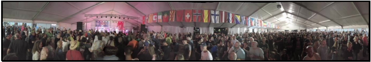
360 Degree photo of the bar and stage area.