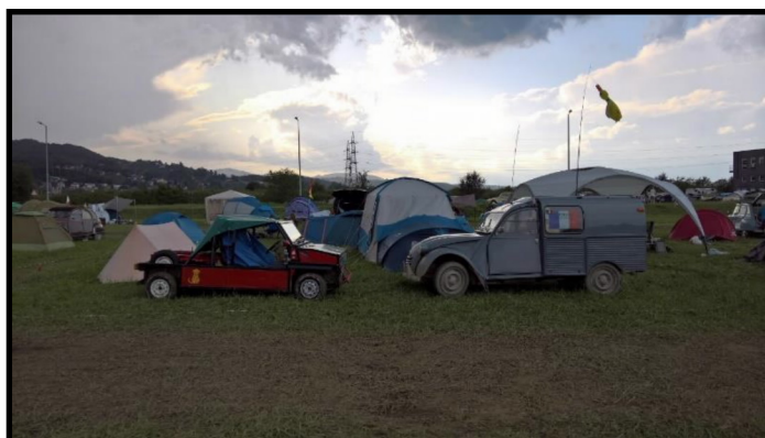
My Scamp and our group of tents.