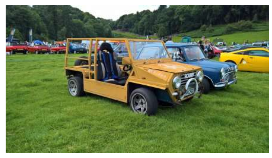
Retro Rides Show – Shelsley Walsh – 2017